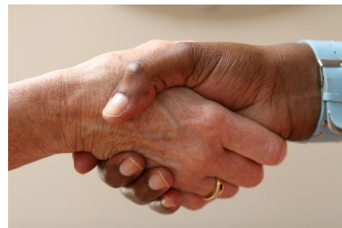
My Sales Team